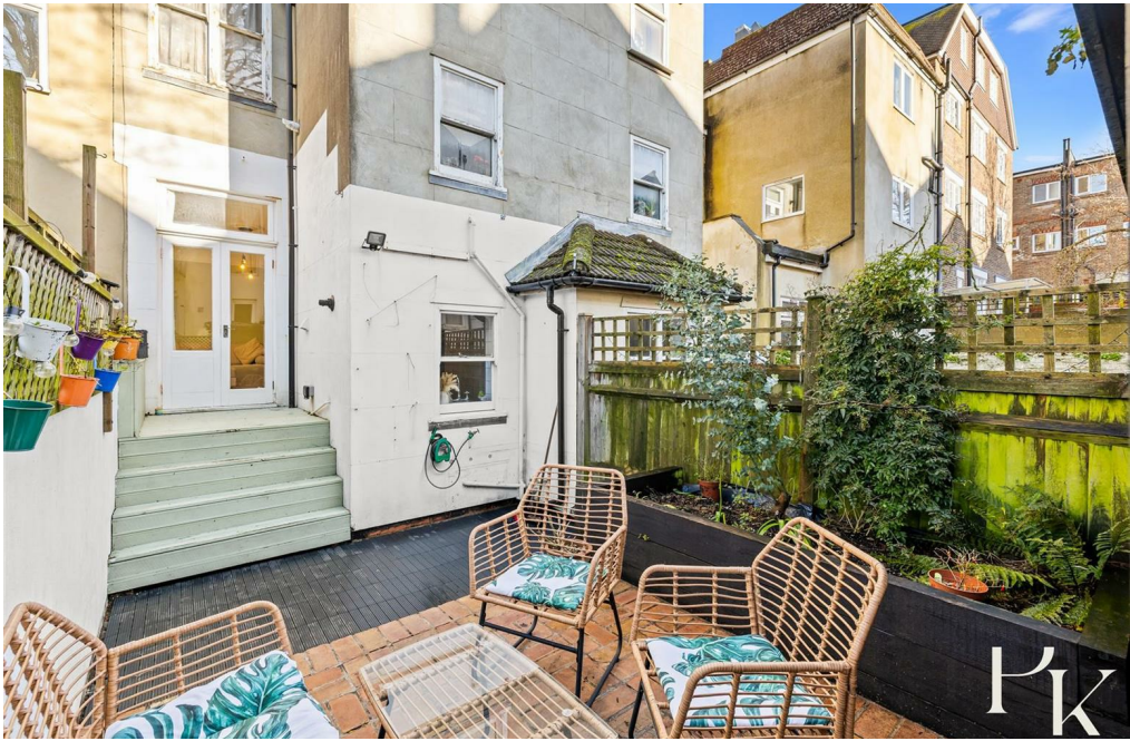
Melville Road, Hove Approximately 49.3 sqm (530 sqft)